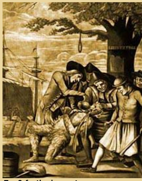
Tar & feathering cartoon

In several of the colonies there were groups of men calling themselves the Sons of Liberty. These men were among the first to call for freedom against the British oppression. At first they met and acted secretly. Eventually, as more and more people became convinced of the injustices of the British rule, they met and acted in public. Their early activities included giving speeches, writing letters, publishing pamphlets, organizing demonstrations, and petitioning government officials.